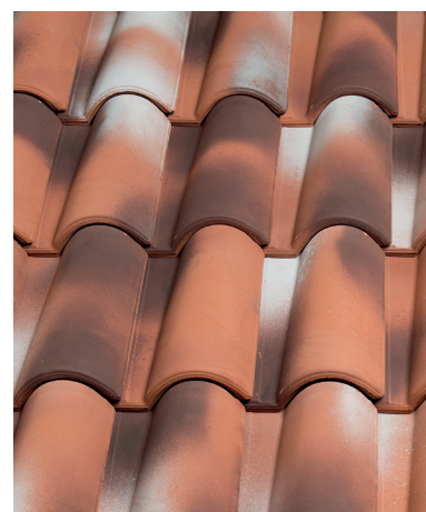
PORTUGUESE EXTRA VENETO