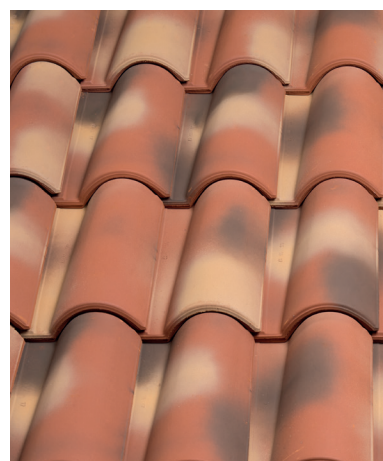
PORTUGUESE EXTRA SORRENTO