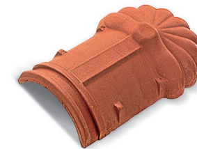
Traditional End Ridge Tile