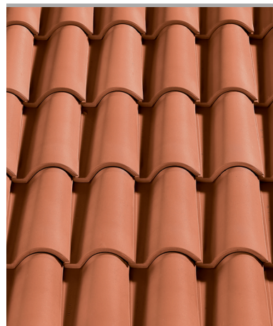
PORTUGUESE EXTRA RED