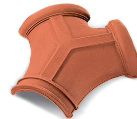
Traditional Three-Way Tile