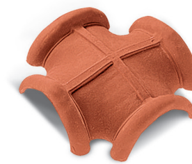
Traditional Four-Way Tile