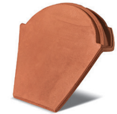
Traditional Front Ridge Tile