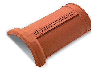
Traditional Ridge Tile ( 2,7 pieces/ linear metre)